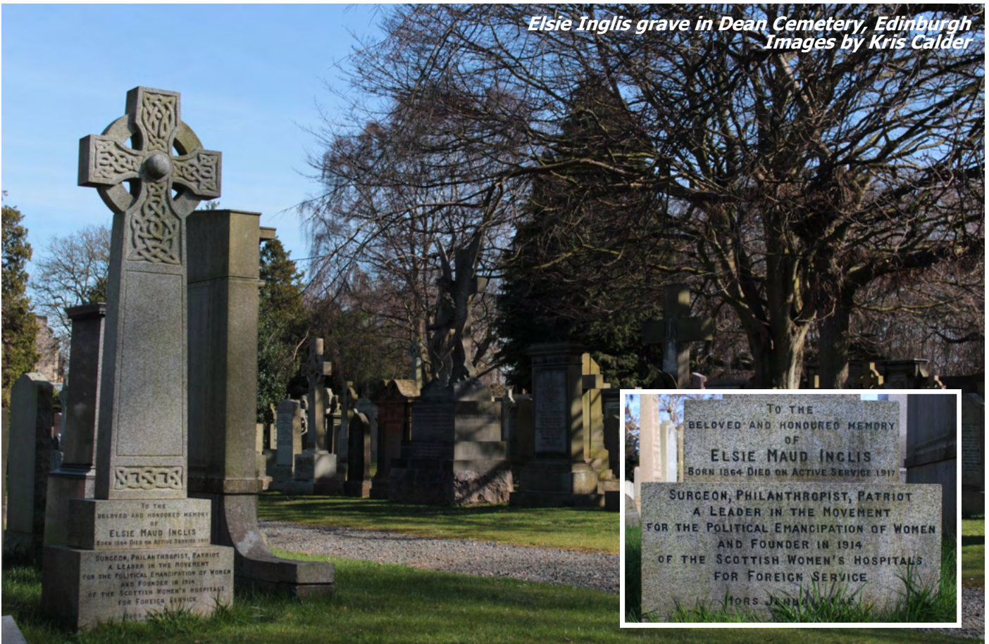
Elsie Inglis grave in Dean Cemetery, Edinburgh

Arthur Balfour, the Secretary of State for Foreign Affairs commented on her death: "Elsie Inglis was a wonderful compound of enthusiasm, strength of purpose and kindness. In the history of this World War, alike by what she did and by the heroism, driving power and the simplicity by which she did it, Elsie Inglis has earned an everlasting place of honour."