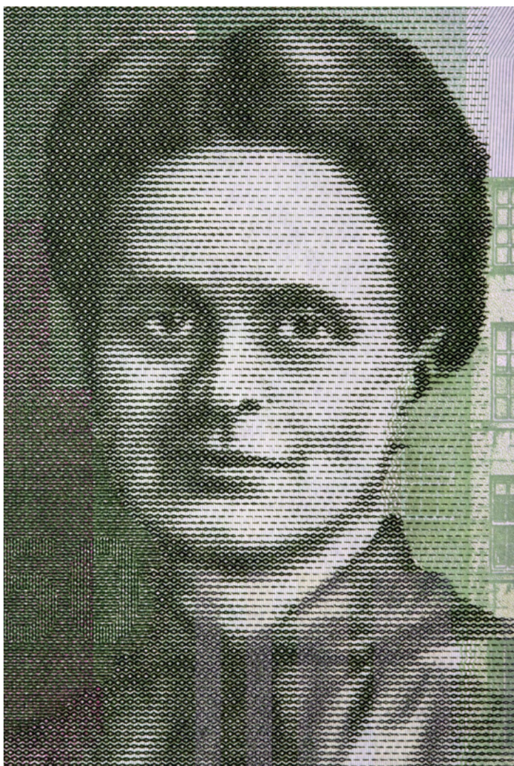
Dr Elsie Inglis — celebrated in 2009 on the Clydesdale Bank £50 note

For a century now we have honoured the sacrifice of the millions of men slaughtered or wounded on the battlefields of Europe and beyond in that 'Great War' to end all wars. Europe abounds with memorials and graveyards, yet little mention has been made of the role of women, and one woman in particular — Dr Elsie Maud Inglis.