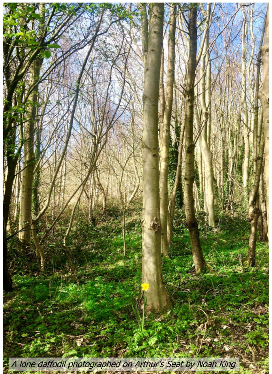
A lone daffodil photographed on Arthur's Seat