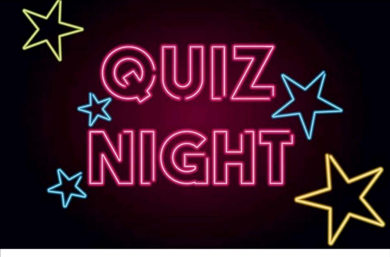
In difficult times we found new ways to be together...